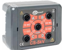
CS-5kV calibration box WAADACS5KV