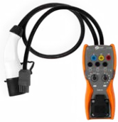
EVSE-01 adapter for testing vehicle charging stations WAADAEVSE01