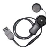
LP-10B light meter probe with WS-06 plug set WAADALP10BKPL only probe with miniDIN-4P plug WAADALP10B only WS-06 adapter with miniDIN-4P socket WAADAWS06