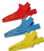
Crocodile clip 1 kV 20 A red / blue / yellow