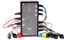
AutoISO-2500 adapter WAADAAISO25