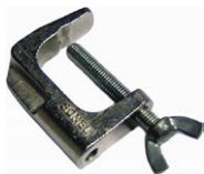
Cramp with banana socket WAZACIMA1