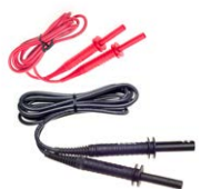
Test lead 5 kV 1.8 m (banana plugs) red / black shielded