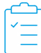
Factory calibration certificate