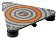
PRS-1 resistance test probe WASONPRS1GB