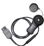
LP-10A light meter probe with WS-06 plug set WAADALP10AKPL only probe with miniDIN-4P plug WAADALP10A only WS-06 adapter with miniDIN-4P socket WAADAWS06