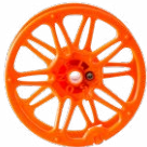
Test wire reel WAPOZSZP1