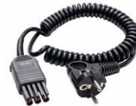
WS-04 adapter with UNI-SCHUKO angular plug WAADAWS04