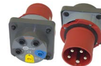
Three-phase socket adapter 63 A WAADAAGT63P