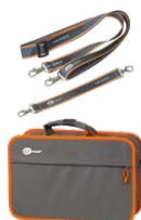
L2 hanging straps (set)