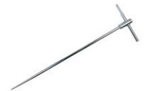
Earth contact test probe 80 cm WASONG80V2