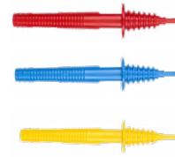
Pin probe 1 kV (banana socket) red / blue / yellow