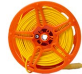
Test lead for earth resistance measurement 50 m WAPRZ050YEBBSZ