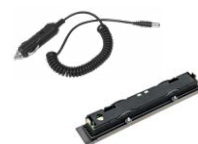
Cable for battery charging from car cigarette lighter socket (12 V) WAPRZLAD12SAM

Mains cable with IEC C7 plug WAPRZLAD230 Z7 power supply WAZASZ7