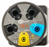
CS-1 cable simulator WAADACS1