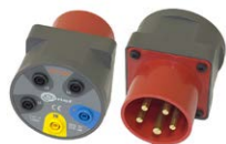
Three-phase socket adapter 16 A / 32 A WAADAAGT16P WAADAAGT32P