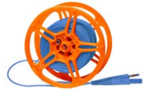
Test lead for earth resistance measurement 25 m WAPRZ025BUBBSZ