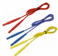
Test lead 1,2 m (banana plugs) red / blue / yellow